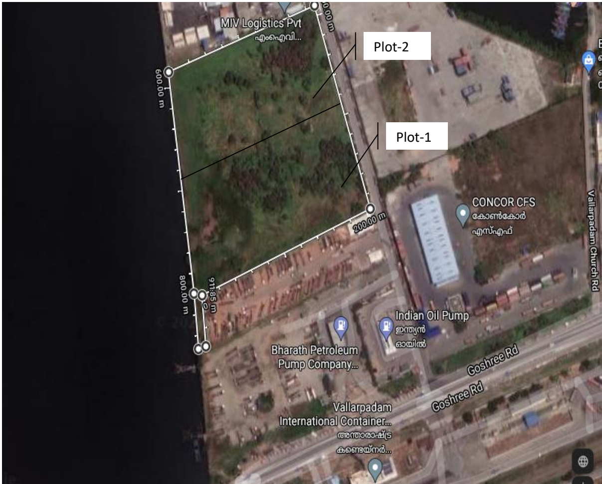
Plot 1 and 2 of 2.0243 ha (5.00 acre) each